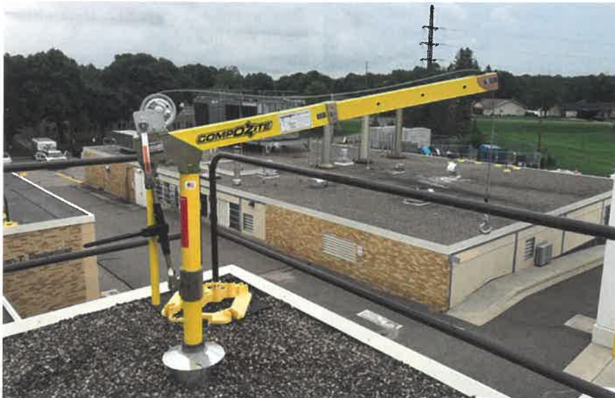
The 1,200-lb. capacity OZ1200DAV davit crane is an integral part of the hospital's overarching height safety program, overseen by Hilmerson Safety.

"In corporate terms, Sustainable Development means being profitable in order to exist in the future. Good corporate management very often leads to positive environmental behavior: in our case, the recovery of steel reduces the use of raw materials. Organizing the workplace differently in a way that takes new ways of working into account (such as part-time,