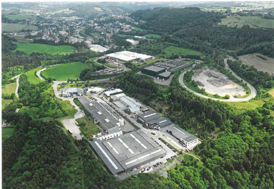
LIFTEUROP takes measures to encourage its employees to adopt an eco-responsible approach.

For more information visit their website at www.lifteurop.com . ■