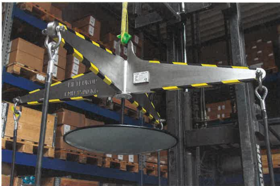
LIFTEUROP: Made-To-Measure, On-Time Delivery and Satisfied Customers.

LIFTEUROP has its own design department to meet specific demands and fulfil its customers' specifications. This design department also develops new products, making sure they meet standards and regulations in force. Whether for lifting beams or specific slinging